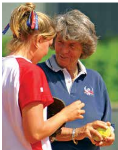
Women’s softball coach at Florida Atlantic University.

Many consider her as “The Greatest Woman Athlete of All Time.” Her jaw-dropping achievements/honors take pages to list, including 20 Hall of Fame inductions, Connecticut Athlete of the Year (selected by the Connecticut Sports Writers Alliance), and a softball field renamed Joan Joyce Field (a part of Municipal Stadium in Waterbury).